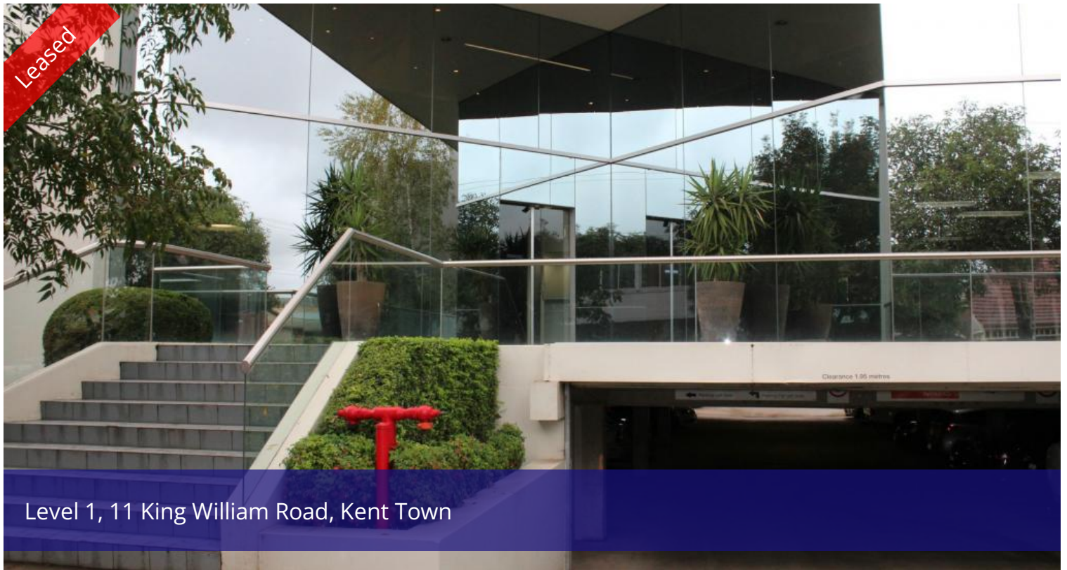
Level 1, 11 King William Road, Kent Town