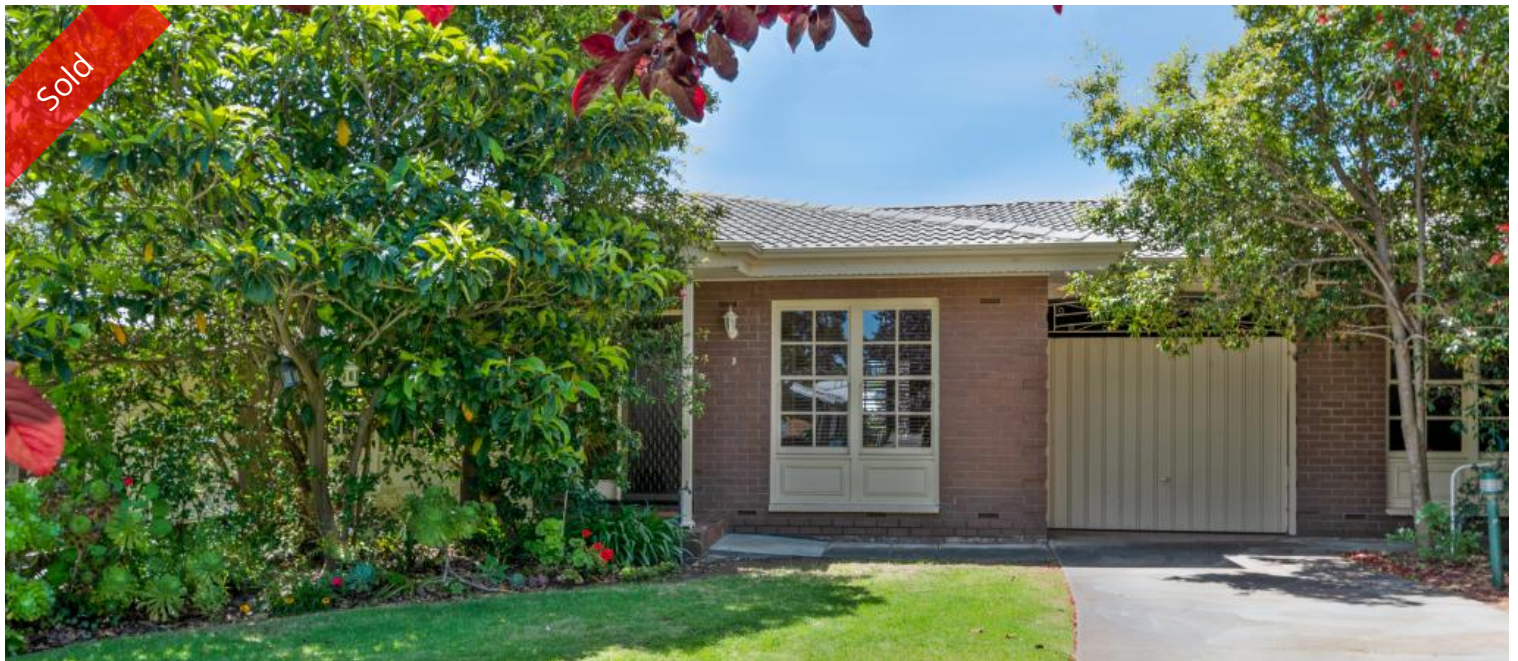
Unit 3, 21A Windsor Rd, Glenside