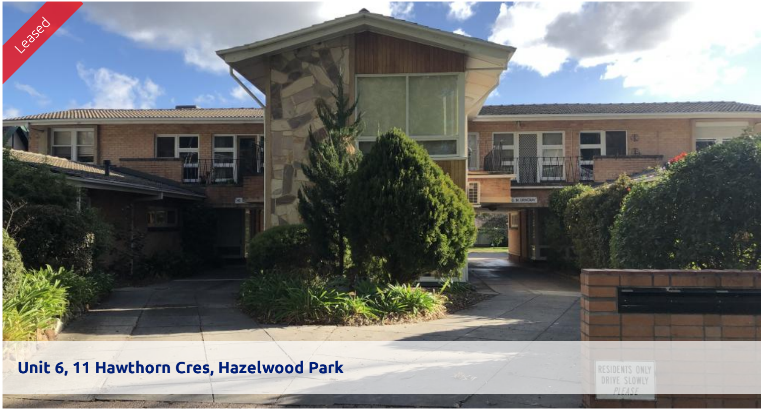
Unit 6, 11 Hawthorn Cres, Hazelwood Park