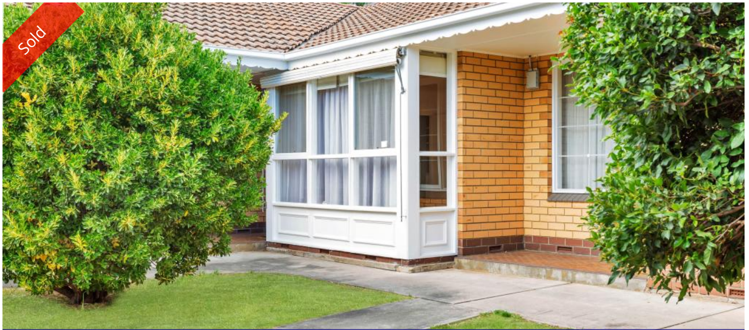
Unit 3/30 Murray St, Clapham