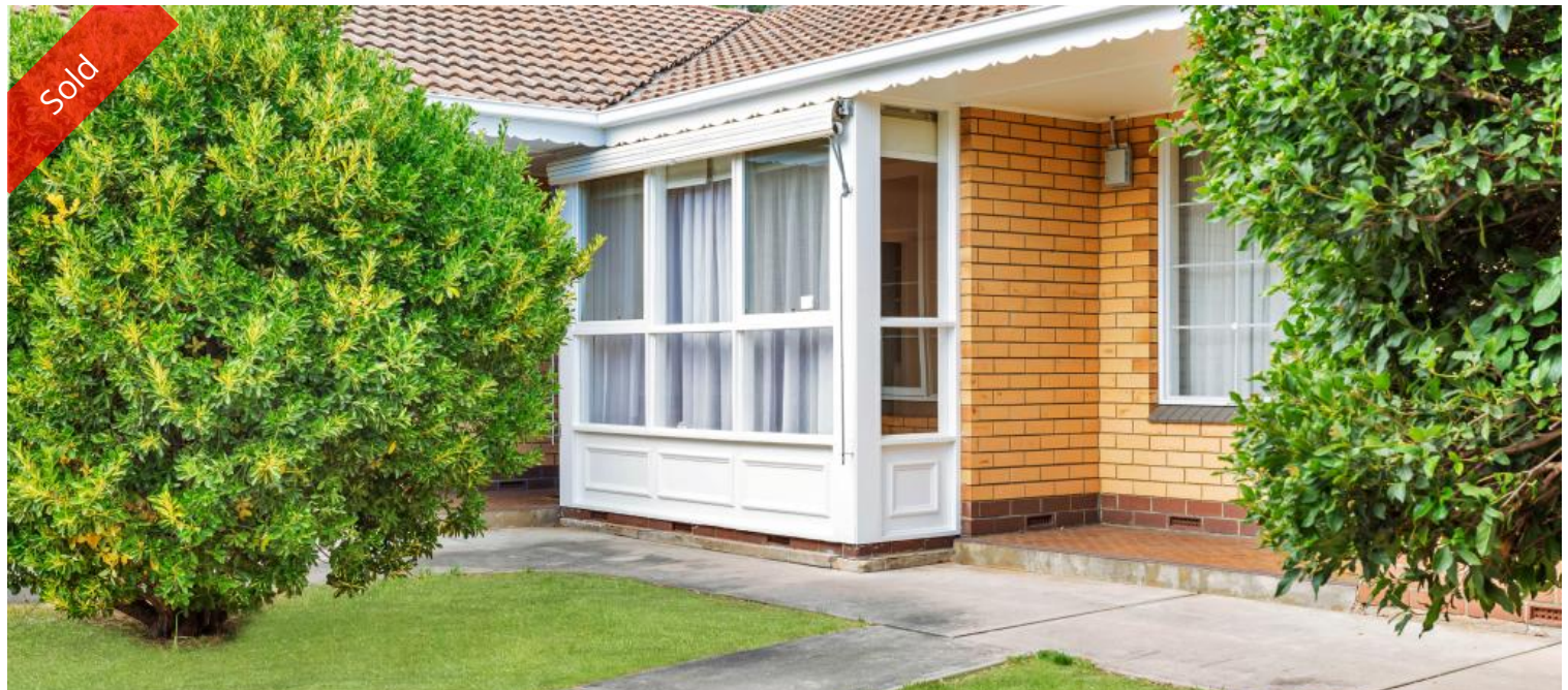
Unit 3/ 30 Murray St, Clapham