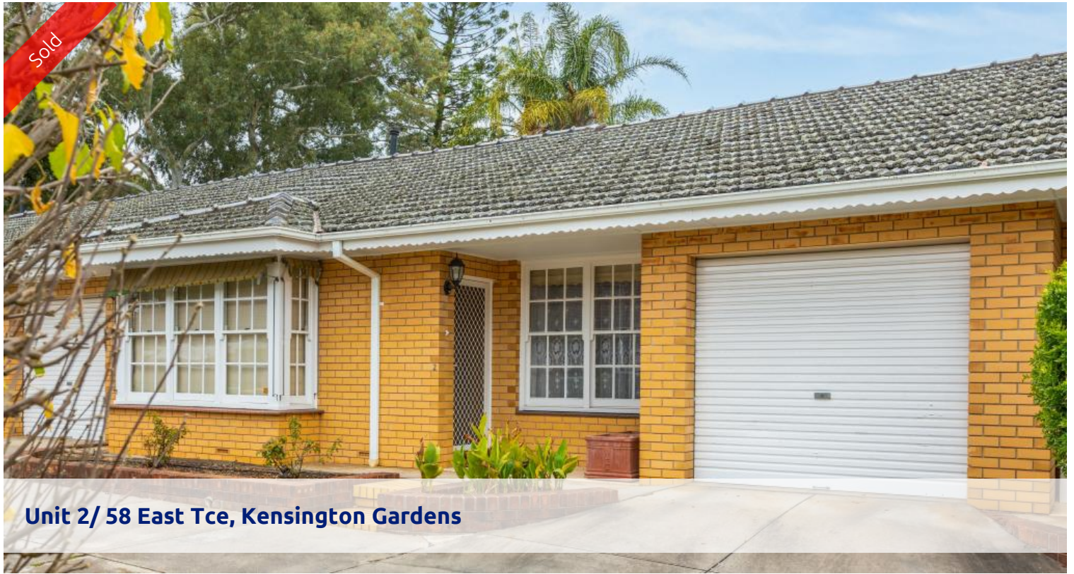
Unit 2/ 58 East Tce, Kensington Gardens