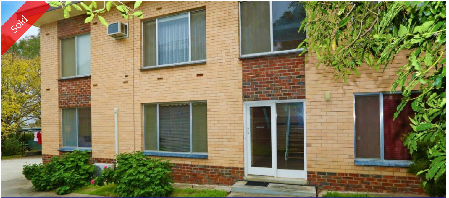
Unit 4, 77A Lockwood Rd, Burnside