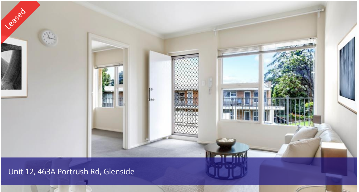
Unit 12, 463A Portrush Rd, Glenside