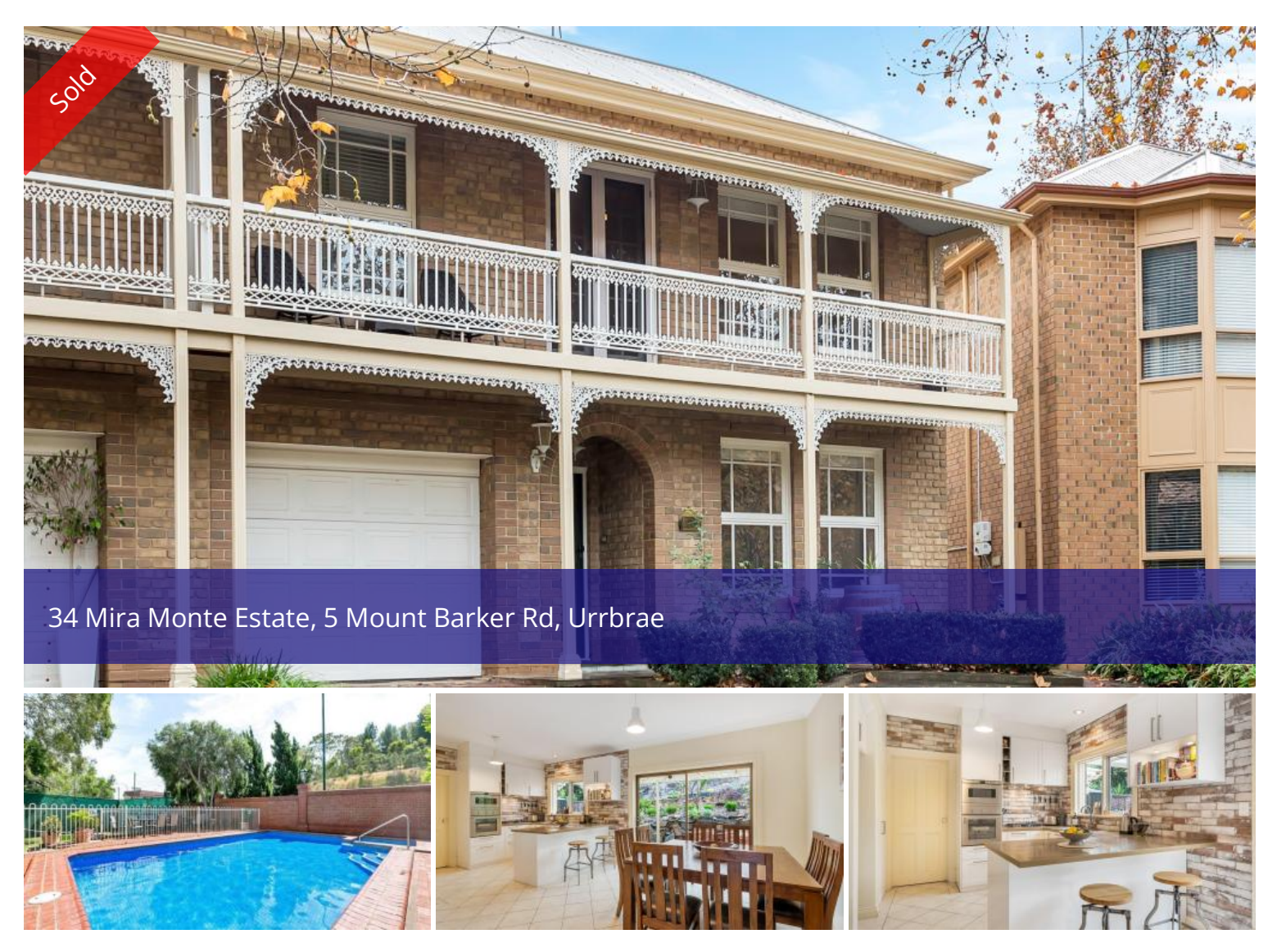
Roomy 2 Level Terrace, Village-like Estate with use of Function Centre, Pool, Squash & Tennis Courts

One of the larger floor plans ever built in the estate and joined to only one other.