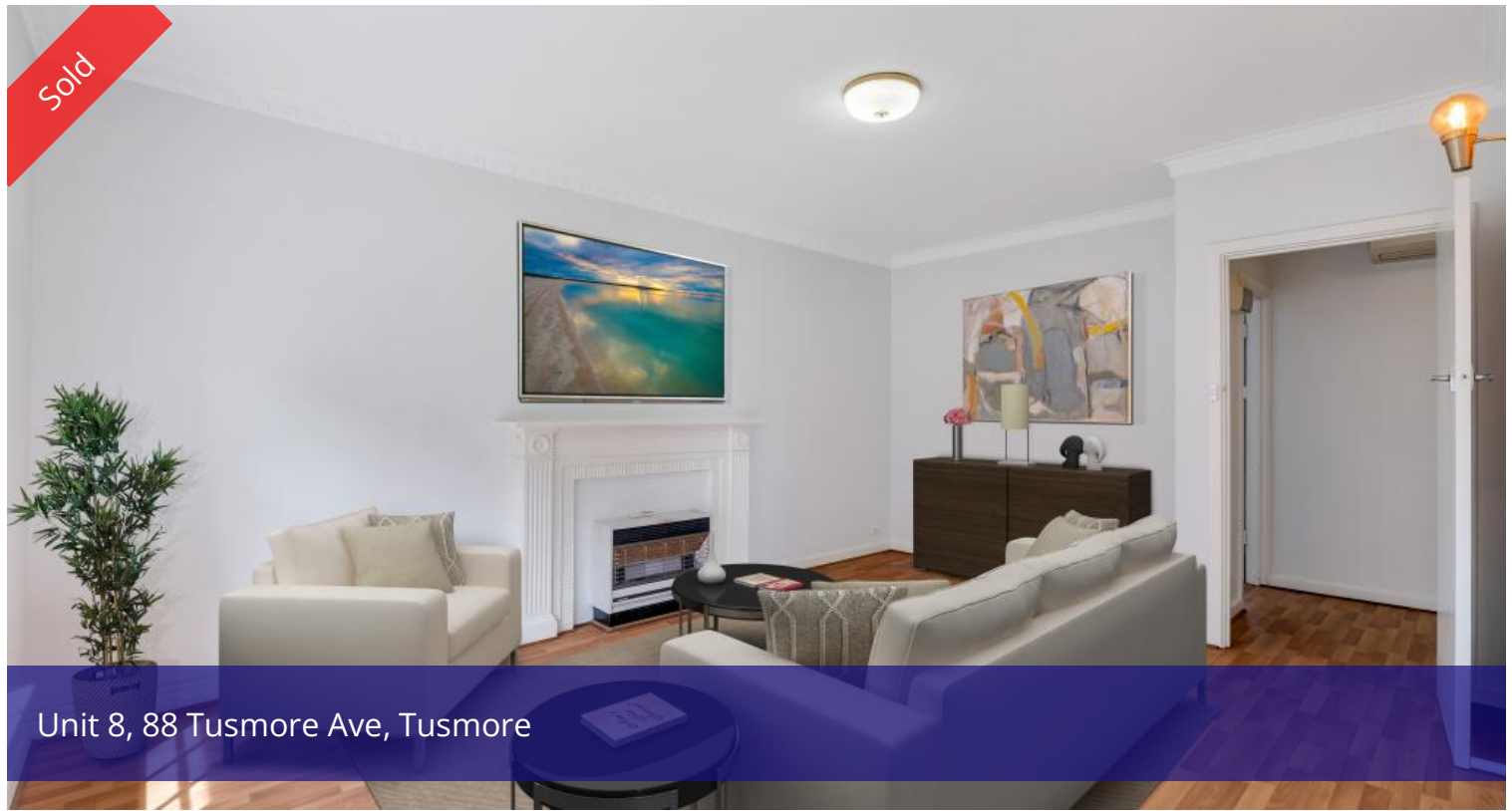
Unit 8, 88 Tusmore Ave, Tusmore