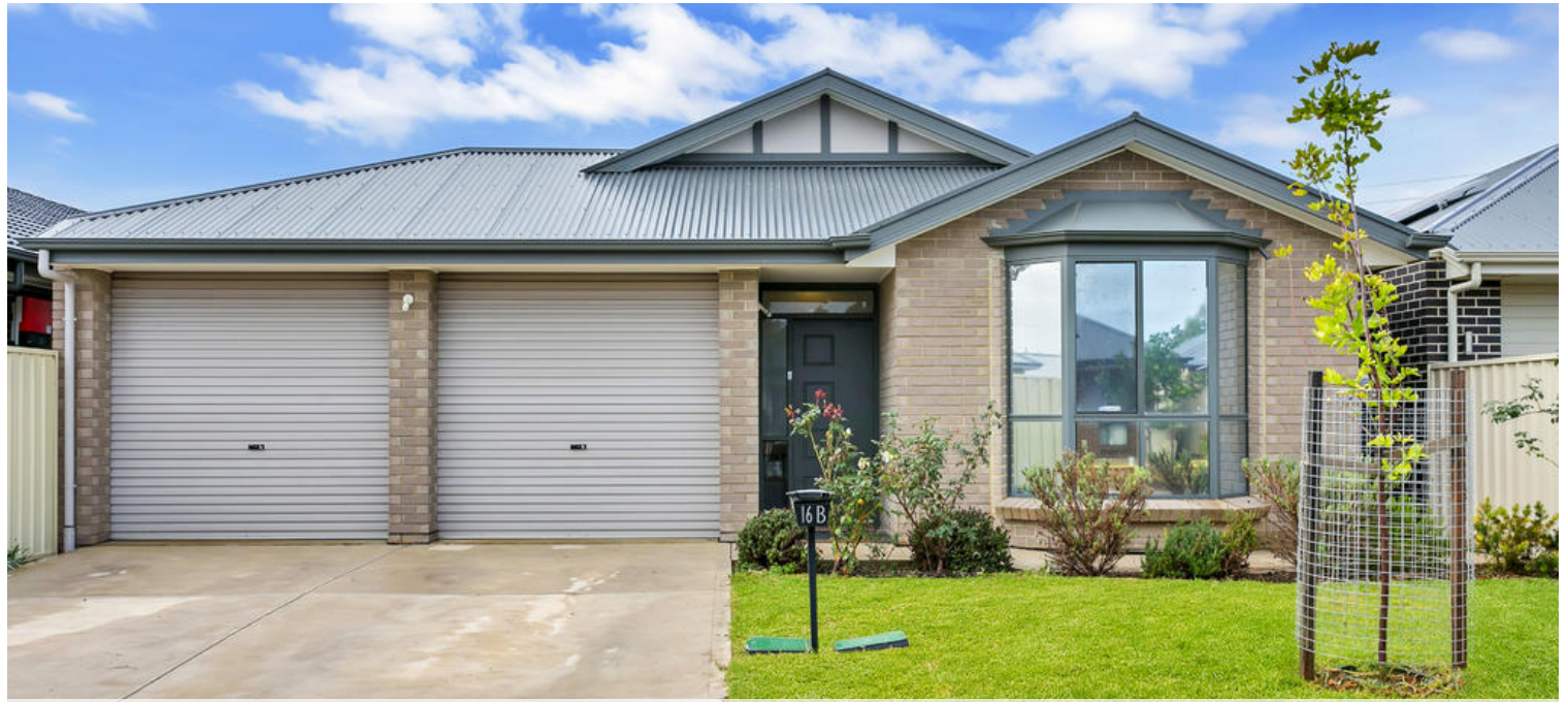
16B Moss St, Parafield Gardens