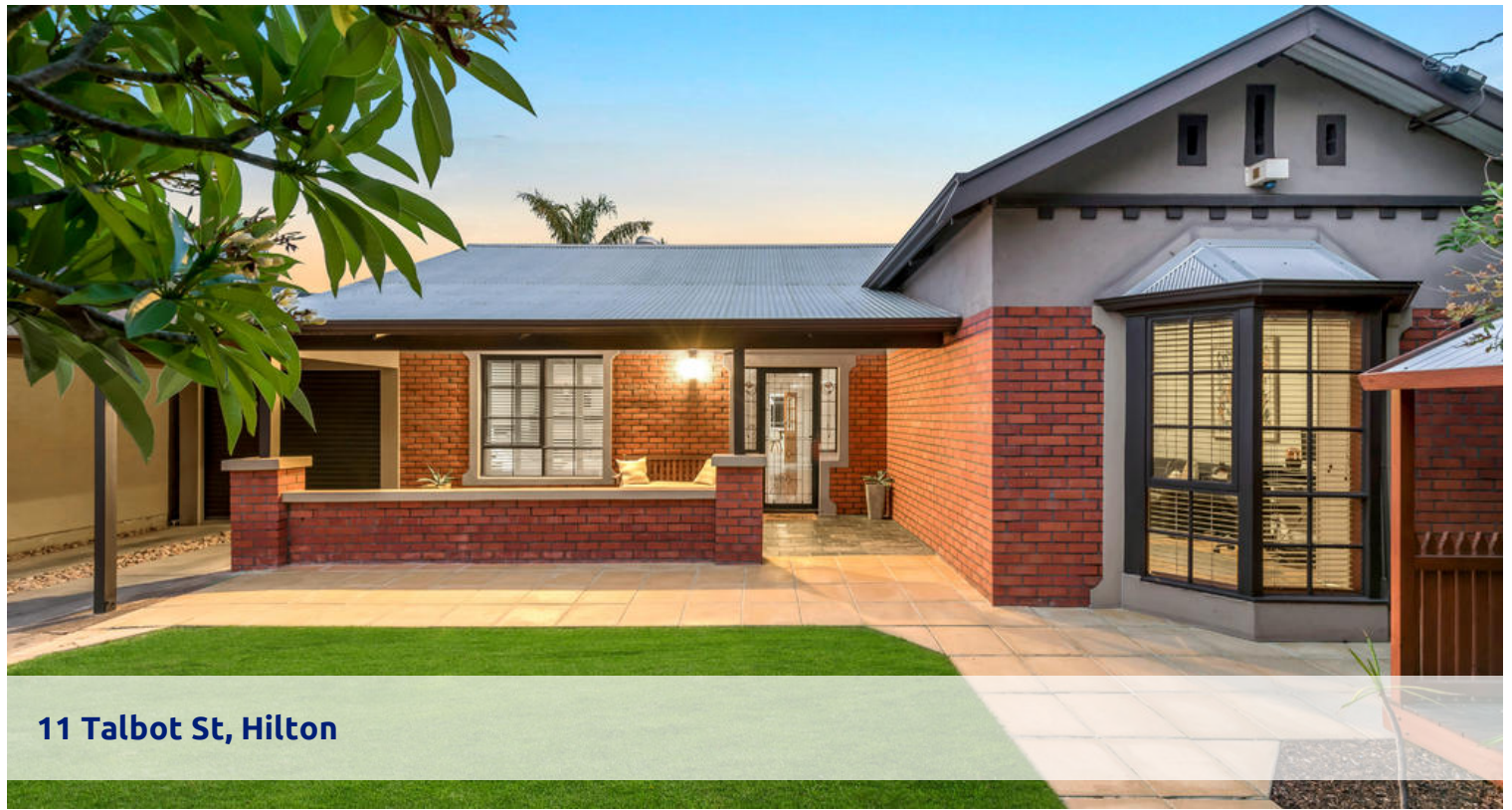
11 Talbot St, Hilton