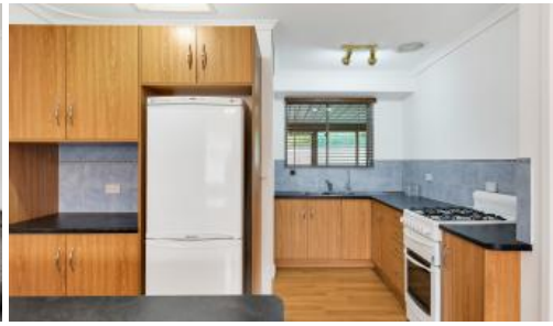
Updated Unit - Separate Enclosed Entertaining Area & Private Courtyard

Add your own decorating touches to further enhance this homely unit or rent out and add to your investment portfolio. Located in a quiet street this truly neat and well cared for unit has seen some appealing up-grades.