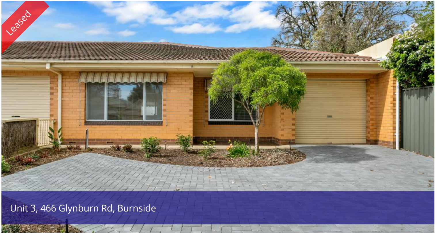
Unit 3, 466 Glynburn Rd, Burnside