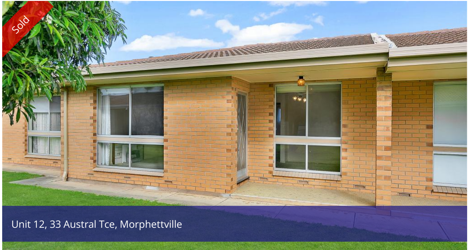
Unit 12, 33 Austral Tce, Morphetville