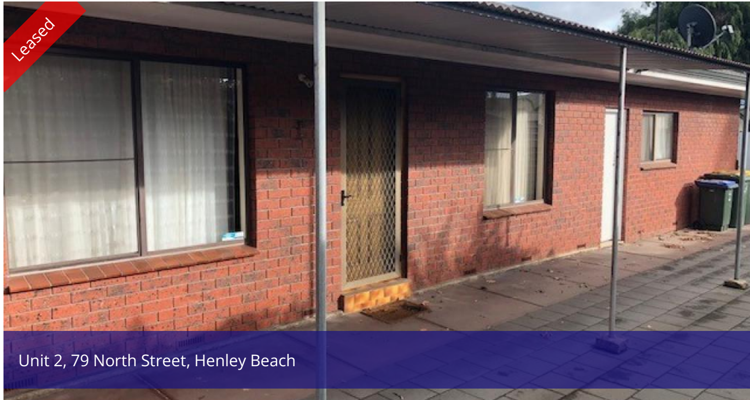
Unit 2, 79 North Street, Henley Beach