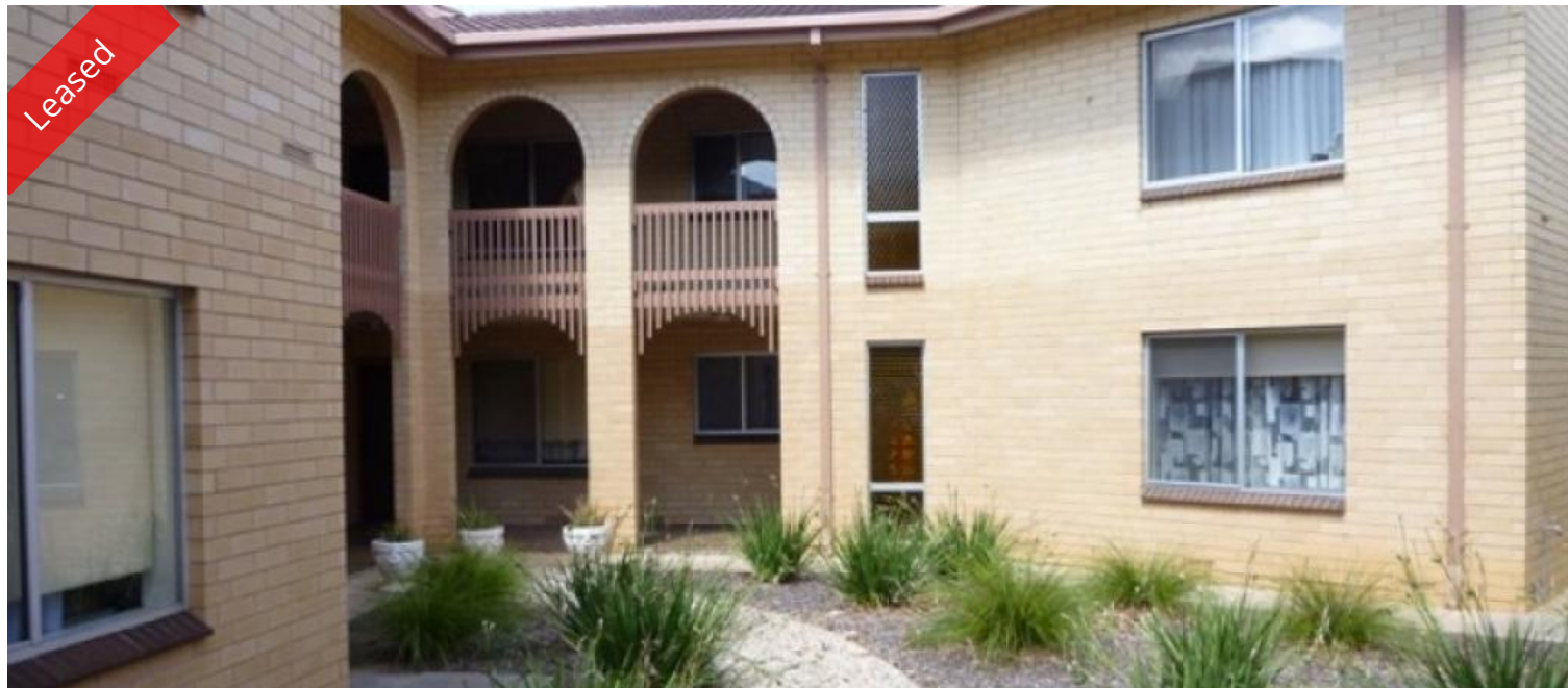
Unit 3, 261 Young Street, Wayville