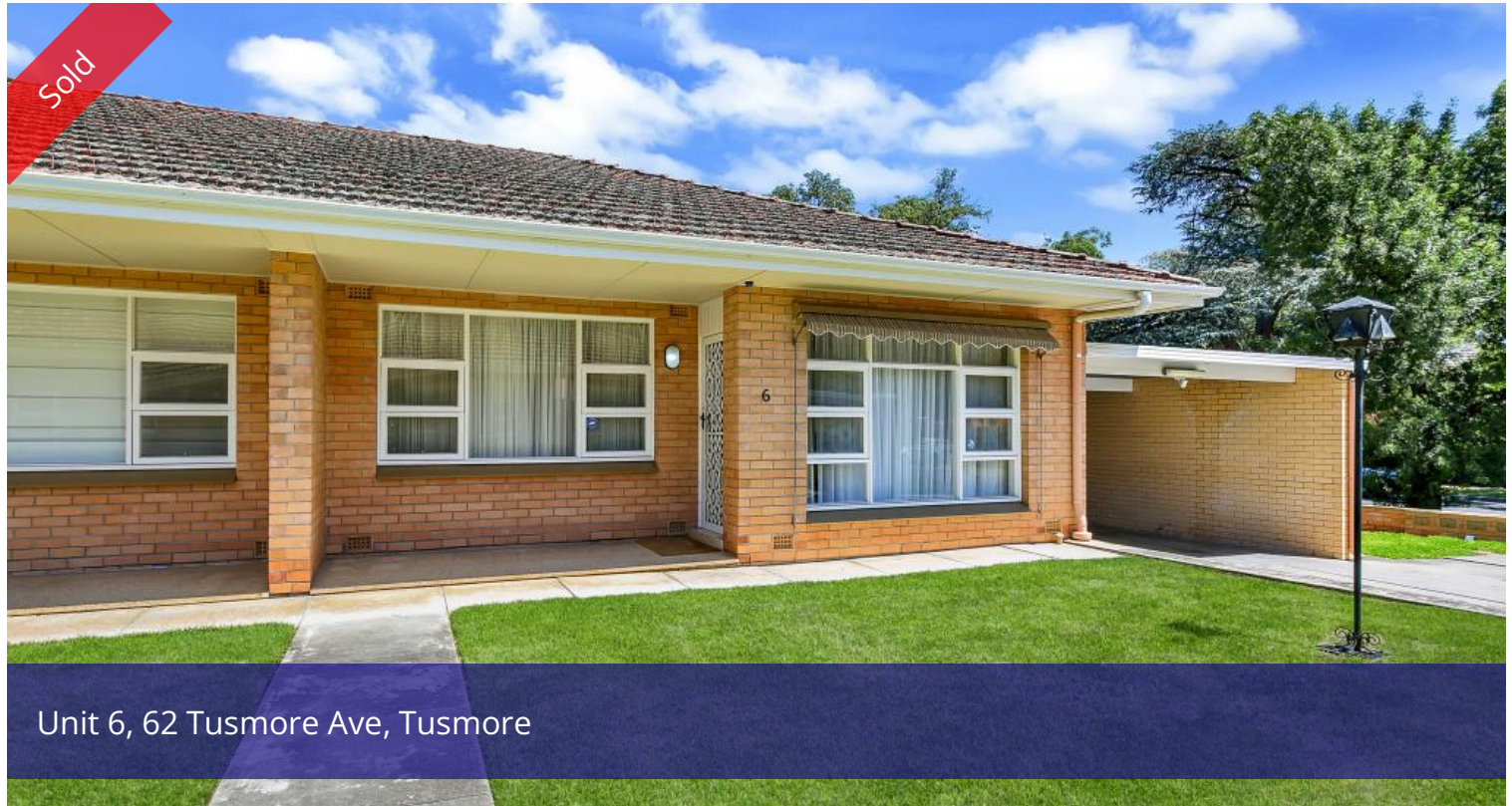
Unit 6, 62 Tusmore Ave, Tusmore