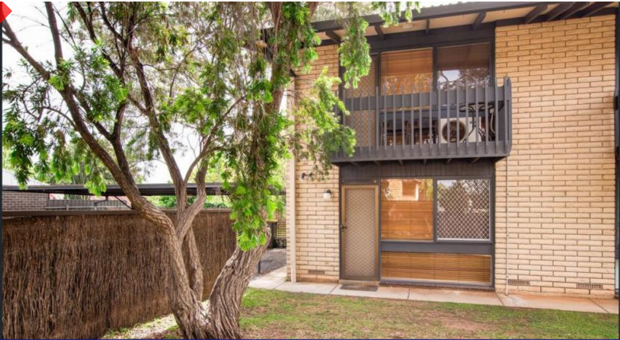
Unit 4, 20 Osmond Tce, Fullarton