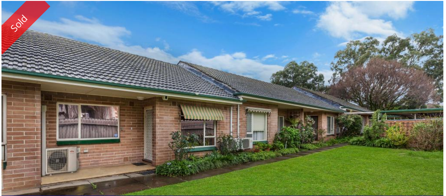
Unit 5, 379 Glynburn Rd, Kensington Park