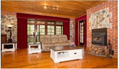
BEAUTIFUL SOLID BLUESTONE REPRODUCTION VILLA IN STUNNING PARK LIKE SETTING

Impressive 2 level family home offering generous accommodation and loads of character. Superbly located close to Heathfield High and Primary Schools, the popular shops and cafes in Stirling, Nature Reserves and local cellar doors the property offers a fantastic hills lifestyle.